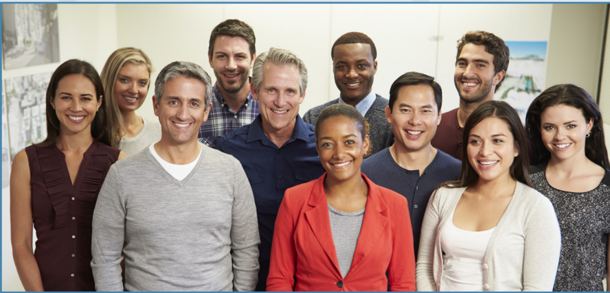
Our Full and Part-Time Staff

My Dear Friends, I can't tell you what a blessing it is to be serving the Lord here in this position! Over the last 15 years I have had the privilege of watching the Lord grow this ministry from the a volunteer only, part-time effort into a flourishing full-service medical clinic. God is doing a great work here through the staff and friends of our center and I want to personally thank each of you who has partnered with us to make this possible. Nothing gives me more joy than to see the look of love on a young woman's face when her baby, once considered a "mistake" or a "problem" has become the light of her life. The gift of hope we share with these women is nothing short of a miracle. Your commitment and sacrifice make this ministry possible. Never has our world needed to be see God's love demonstrated more desperately than it does today. We have the